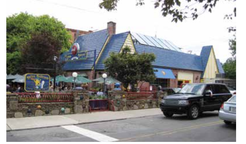
Mellow Mushroom, located in Asheville, North Carolina, installed a solar thermal hot water system as part of its Efficient Heating and Cooling initiative. The system was sized to produce 20 percent of the restaurant's hot water consumption in a day, and can be expanded to provide more in the future.

to provide more in the future. Capturing the savings that North Carolina has to offer, and considering the fuel costs, the system has a great payback. Because the restaurant's water needs are heavy and constant, its storage needs were relatively low, and required only a 120-gallon storage tank. The collectors increase the temperature of the water from 40°F to about 120°. To bring the water up to 160°, the higher temperature required for dishwashing, the restaurant uses