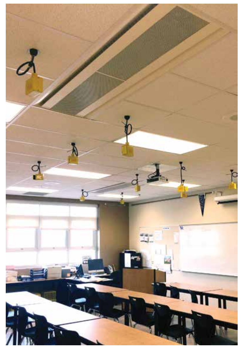
Chilled beams don't require filters or any moving parts, which reduces the number of maintenance-related classroom interruptions.