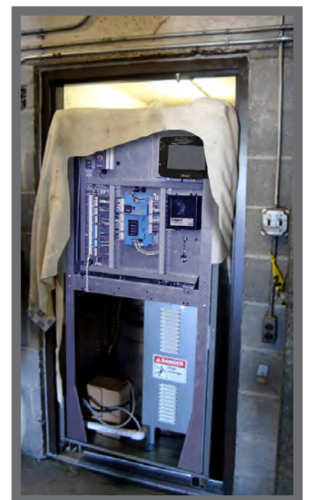
3000 MBTU's fitting through a standard door.