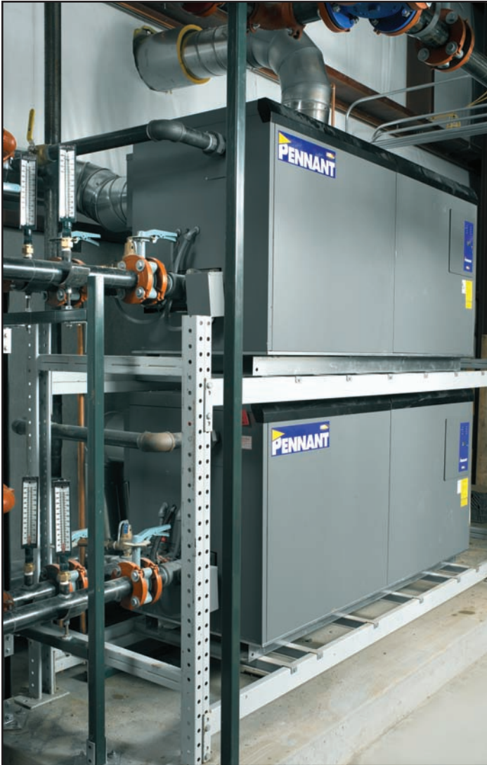
FIGURE 2. Two 1.5 million Btu, fan-assisted boilers are at the heart of the radiant heating system. The units operate at 85% efficiency with four-stage control to meet demand.

would be failure of one of the ignition systems, the other takes over.”