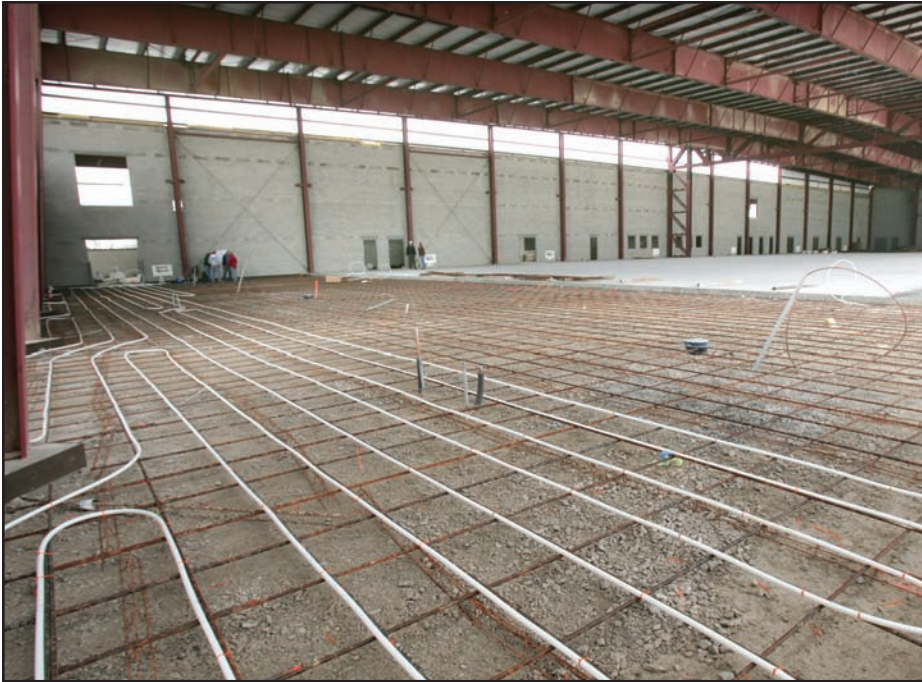
FIGURE 1. More than 55,000 lineal feet of radiant heating tubing was used at AirNet Systems new hub in Columbus, OH.

size, Muetzel (who especially enjoys piping layout and design), and experts from the project's general contracting firm, Ruscilli Construction Co., and Cromer settled on a plan that would create four separate, 13,250-sq-ft slabs, each measuring 75 ft by 150 ft.