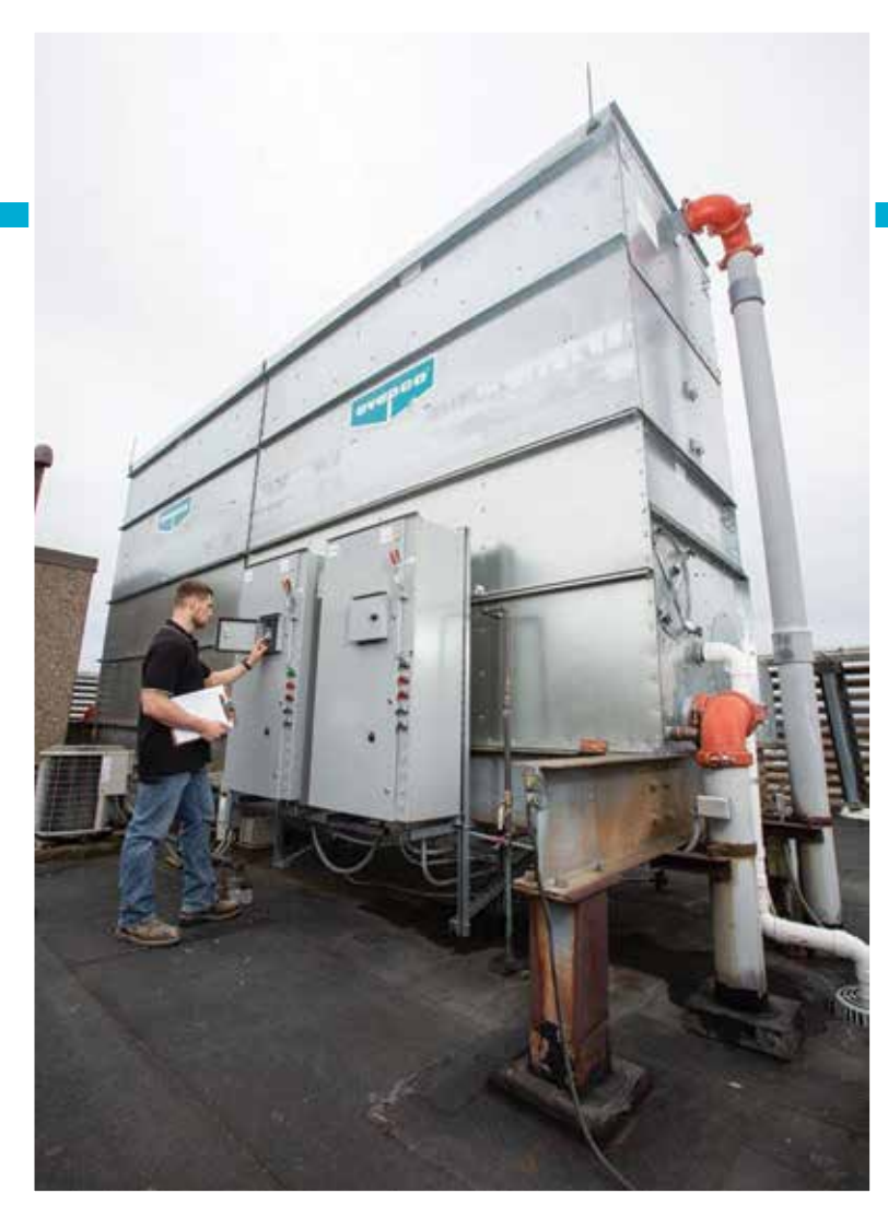
TWO TOWER: New Evapco cooling towers replaced the units that had served Wall Street Tower since it opened.