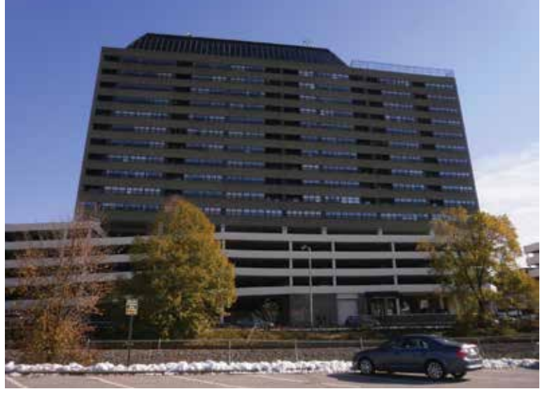
UPGRADE: Wall Street Tower, a 17-story residential facility built in 1986, recently underwent a complete HVAC retrofit.

The original modular style boiler plant had done its part and needed to be replaced. The owners contracted Denron Plumbing and HVAC LLC, a local firm specializing in commercial hydronics. Several months earlier, Denron had replaced the original cooling