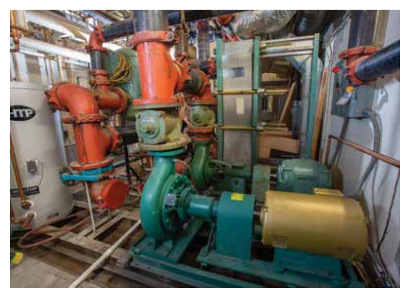
KEEPING WARM: The updated heating system keeps tenants warm during the chilly winters of New England.