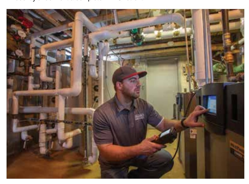
IMPRESSIVE CONTROLS: A tech with Dennon Plumbing and HVAC LLC checks the controls on a Laars boiler.

tower with an Evapco unit and installed variable frequency drives (VRF) for 40-hp pumps that circulate fluids to and from the rooftop coolers.