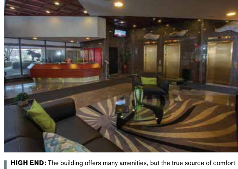
lies in its hydronic heating system.

"As part of the design-build effort, we were asked to help with the specification of key hydronic components, including a 20-hp, 6-inch-by-5-inch FI base-mounted end-suction pump; a 132-gallon [ASME-certified] expansion tank with two multipurpose valves; and an 8-inch air separator — all in the fluid path between the Laars boilers and the heat pumps," said Reid Goodrich of Emerson Swan.