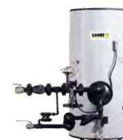
HOT WATER GENERATORS