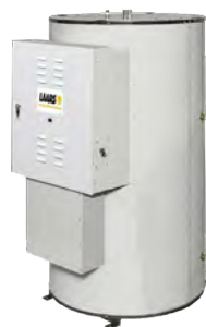
COMMERCIAL ELECTRIC TANK TYPE WATER HEATER