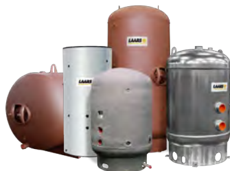
LARGE VOLUME STORAGE TANKS