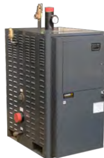
COMMERCIAL ELECTRIC BOILER