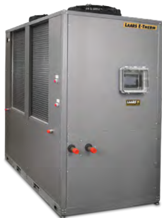
HEAT PUMP WATER HEATER