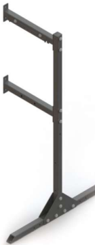
Extension Rack ST1250

One Base Rack and one Extension Rack holds up to four heaters. More extension racks can be added, allowing for more heaters to be mounted together.