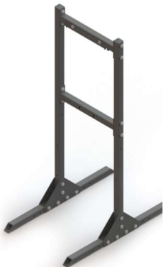
Base Rack ST1249

Extension rack ST1250 is used with the base rack, to add one or two heaters to the system, either side-by-side, or back-to-back.