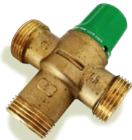
Thermostatic Mixing Valve