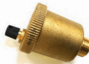
Automatic Air Elimination Vent