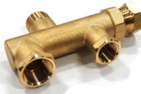
3-in-1 Brass Pipe Adapter Easily mount PRV, Air Eliminator, and External LWCO