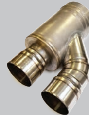
Concentric Stainless Steel Endurance Adapter Kit FT3006