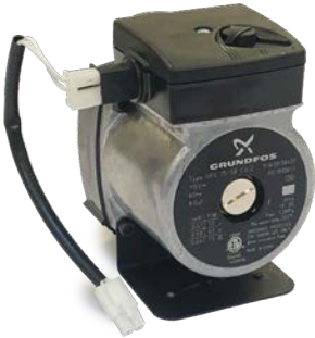
Grundfos Boiler Loop Pump (installed)