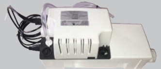
Condensate Neutralizer & Pump FT3007