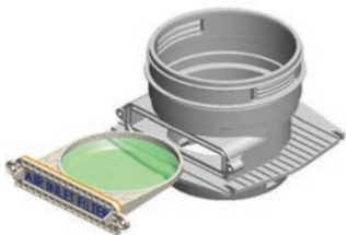
Air Intake Filter (installed)