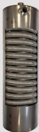
Domestic Hot Water Mini-Tank

By combining both storage and recovery capacity, the FT Series Combi boiler's unique, integrated domestic hot water mini-indirect tank delivers stable hot water on demand.