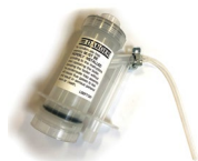
Primeless Condensate Trap (Installed)