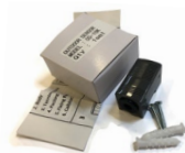
Outdoor Sensor Kit