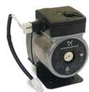
Internal Circulator (Installed)